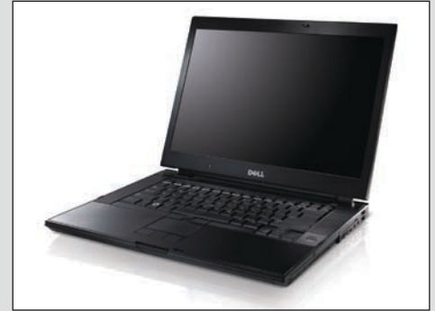
Figure A. The Dell Precision M4400: Powerful and feature-rich graphics

The Dell Precision M4400 is a mid-size mobile workstation designed to be a true replacement system for workers who need a mobile system but require excellent workstation performance. In particular, it is designed to deliver leading-edge graphics performance for applications such as video editing, mechanical assembly design, animation, digital content creation, and any others that require extensive manipulation of OpenGL models. The Dell Precision M4400 offers independent software vendor (ISV)-certified application performance in a midsize, durable 15.4-inch LCD form factor with a target entry weight of 5.92 pounds (see Figure A). * The Dell Precision M4400 utilizes the NVIDIA Quadro FX 770M graphics engine and 512 MB of dedicated graphics memory, along with upcoming quad-core Intel mobile processors.