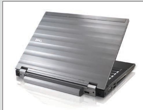
Figure B. The Dell Precision M2400: Enhanced mobility for workstation performance

The Dell Precision M2400 is a lightweight mobile workstation designed for workers who need certified workstation-class performance but require excellent mobility as well. In particular, it is designed for highly mobile users such as executives, creative designers, and other mobile professionals who need