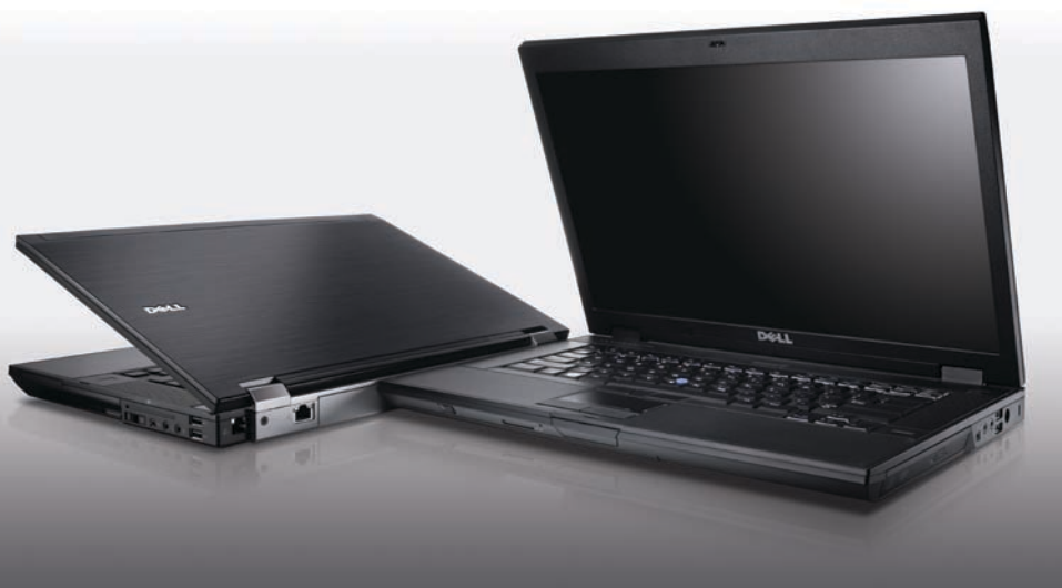
New Dell Latitude laptops provide outstanding control and manageability in a sleek, durable design (from left: Latitude E4300 and Latitude E6400)